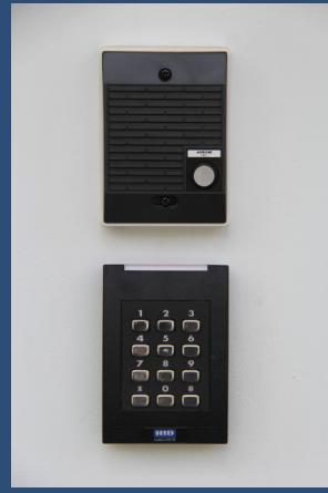
The new security buzzer and keypad at the Stokes Hall door.

As MFS prepared for the return of students to campus for the 2022-2023 school year, a few new security measures were put in place around the school to ensure the safety of all students and faculty during school hours. These measures included new locks, notably on the Stokes Hall and Dining Hall doors; new ID badges for all students and faculty that will serve several purposes; and a new visitor-screening system at the Front Desk.