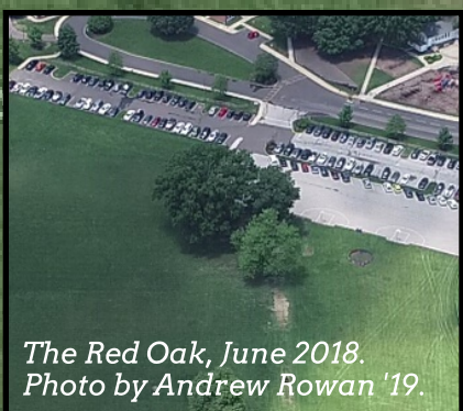
The Red Oak, June 2018.