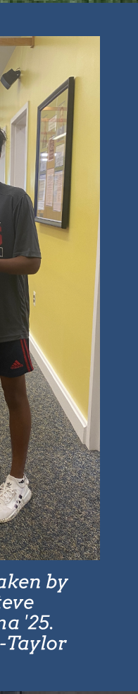
taken by eve na '25. -Taylor